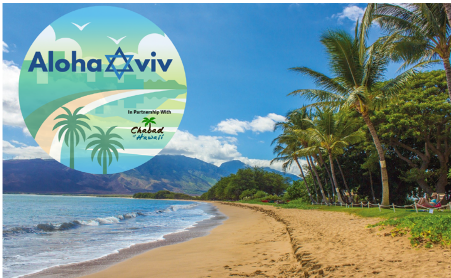
Aloha Aviv is giving students the chance to spend their spring semester in Hawaii.