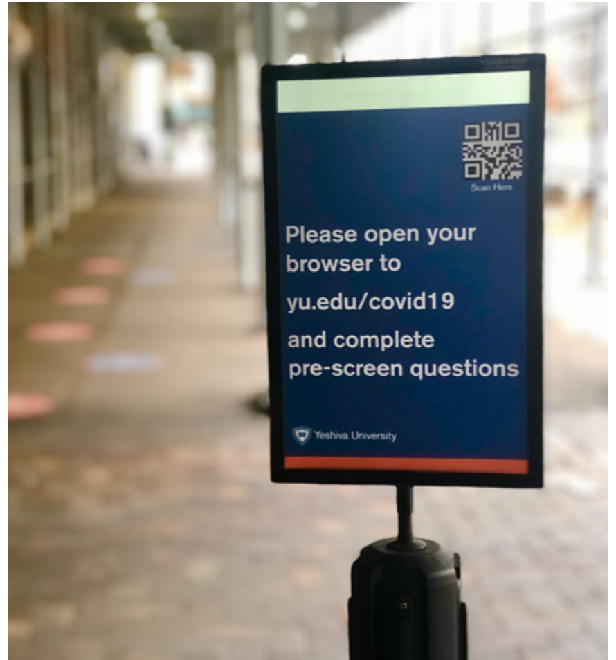
Students who are on campus receive weekly reminders via email to sign up for their required COVID-19 tests.

“I think it is a really smart idea to deactivate somebody’s card if they don’t get tested because consistent testing is the way YU has maintained the safety of its campus,” commented Neeli Fagan (SCW ‘22). She also noted that the system has some problems, such as with some students who had been locked out of their dorm buildings because their IDs were deactivated. “Other than that,” she said, “I think it is a really good idea; maybe it just should be a little more balanced.”