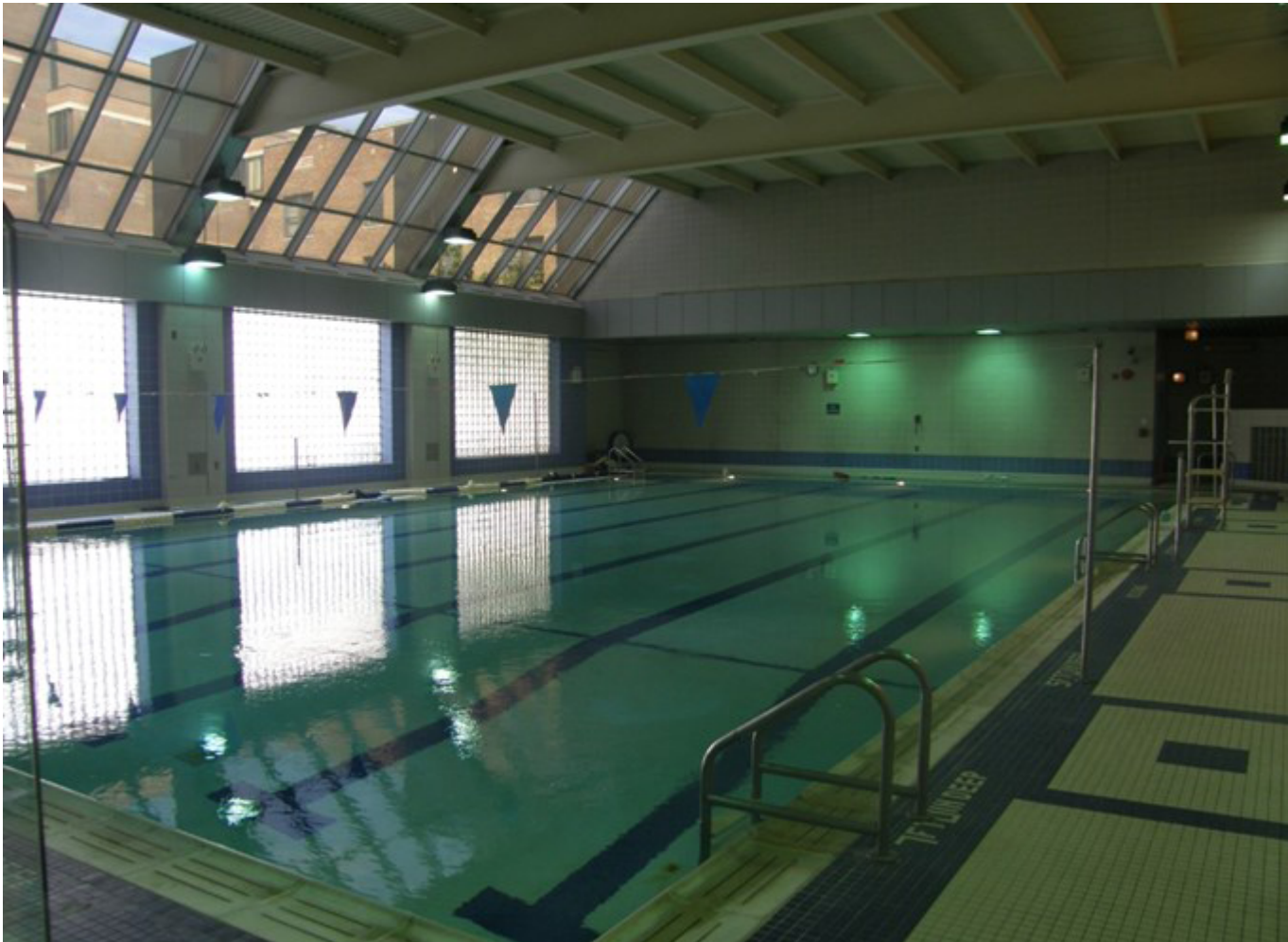
The Benjamin Gottesman Pool, Wilf Campus