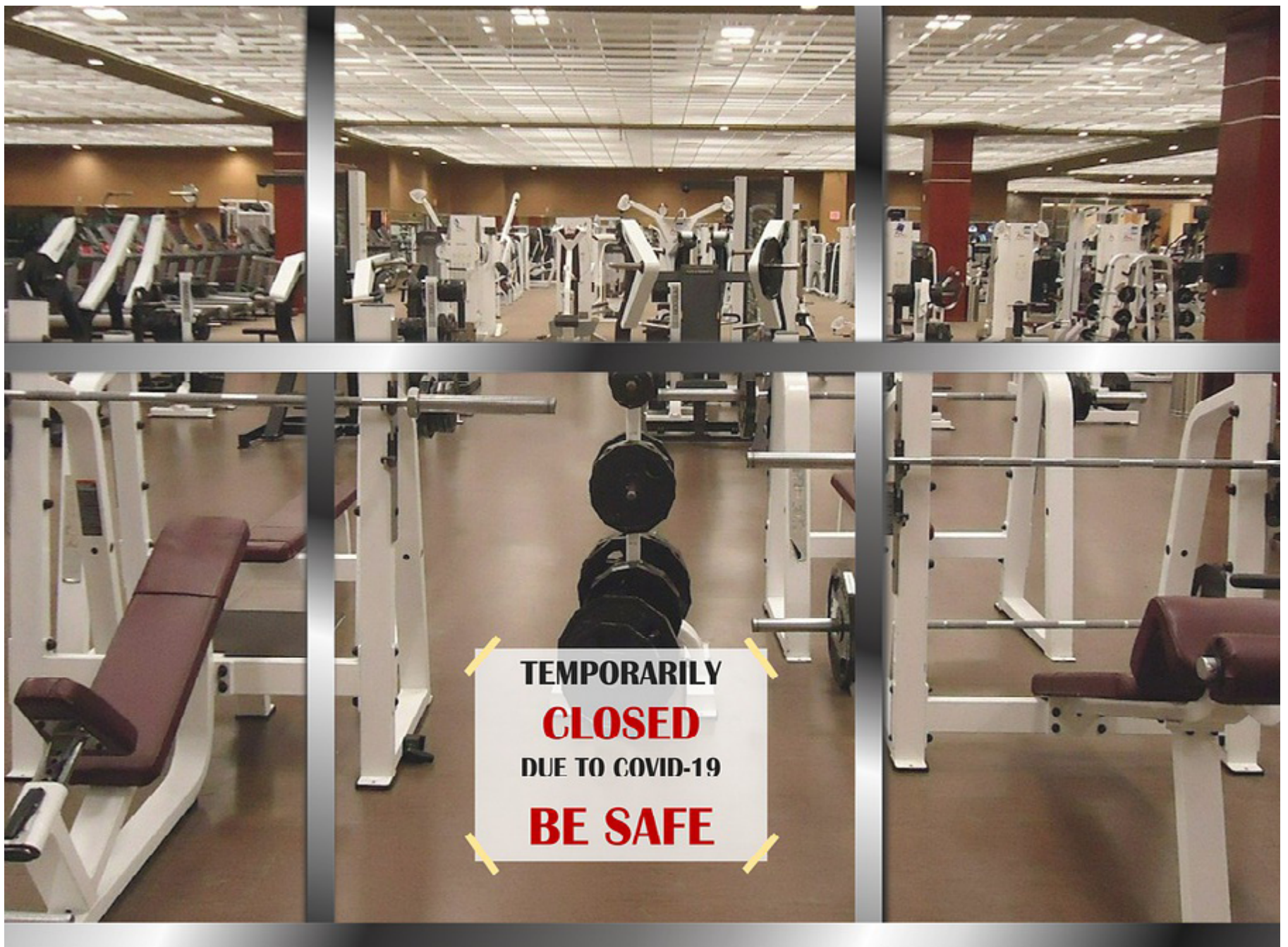
There has been a shift during COVID-19 to at-home workouts.

working out more. A recent study conducted by Mindbody, an online wellness platform, showed that 56% of respondent consumers work out five or more times a week. Additionally, Peloton recently reported that “connected fitness subscribers are averaging 24.7 workouts per month, up from 12 a year earlier”. When respondents in the Mindbody study were questioned on the benefits of working out at home, there was a surprising recurring theme. Many attributed their increase in working out to the ability to try new things without fear of judgment. Removing themselves from experienced