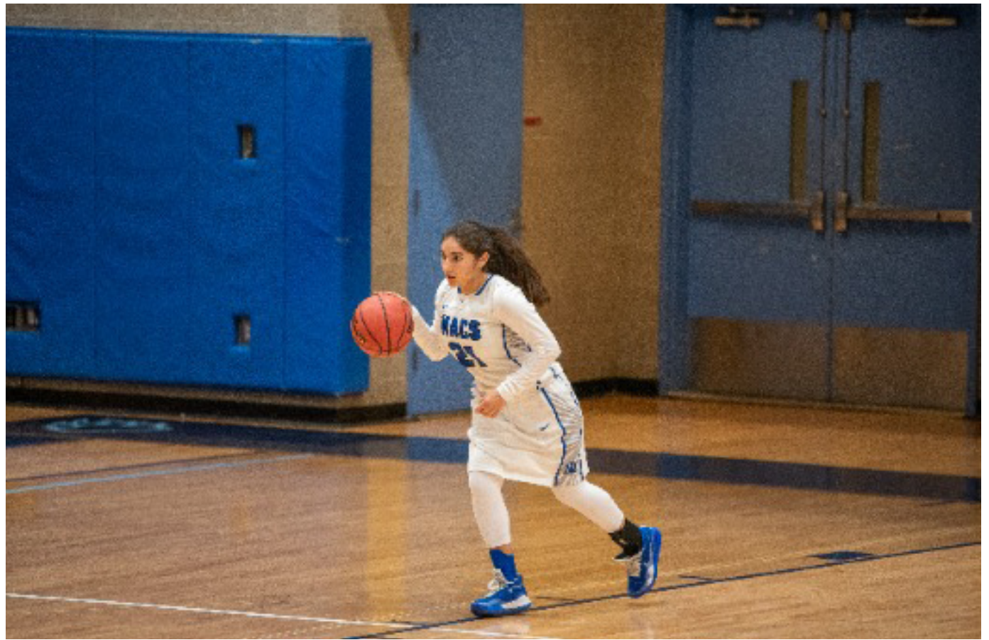
The women's basketball team, for years now, has not been allowed to practice or play their home games in the Max Stern Athletic Center on the Wilf Campus.