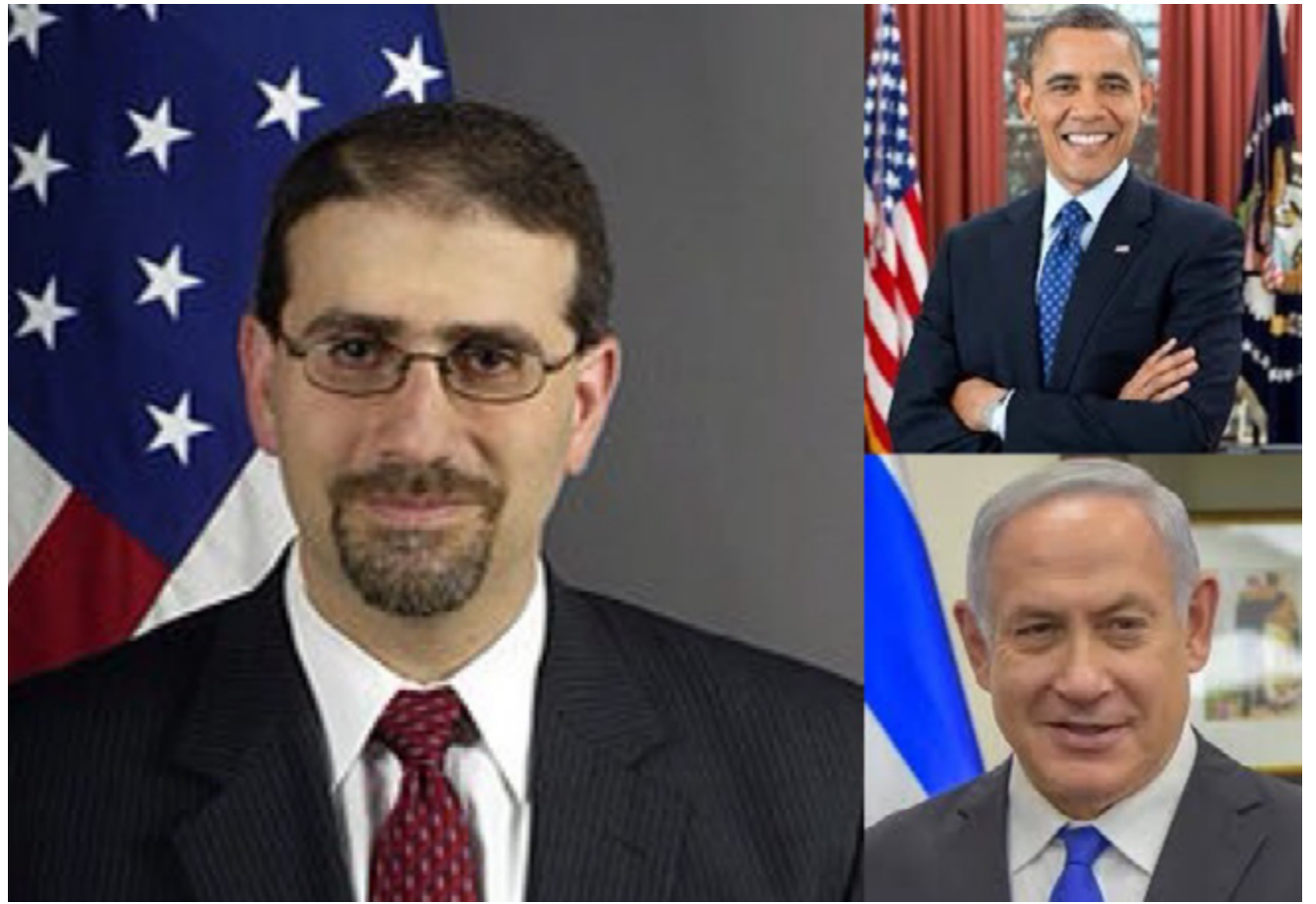
Shapiro was appointed ambassador of the U.S. to Israel under Obama in 2011 and served until the end of Obama's term in 2017.

Shapiro also said, "I look forward to visiting Yeshiva University in person in the future to continue the discussion."