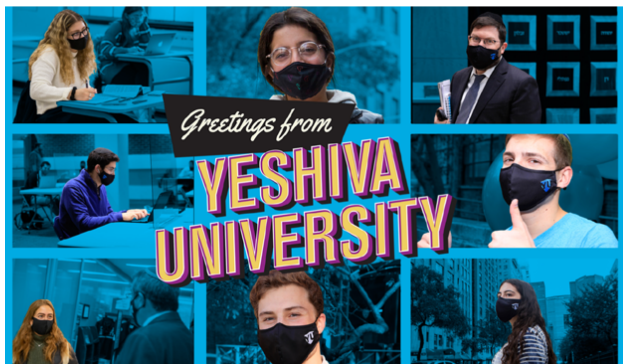
YU graphic of current life on campus.

"Assuming the COVID-19 cases don't spike and NYC isn't all but shut down, my hope is to live on campus next semester. It's hard to say whether or not this will happen given the rising cases across NYS and even in YU, the latter of whom was doing really well for the first month. For now, it's definitely going to be a wait-and-see type of thing."