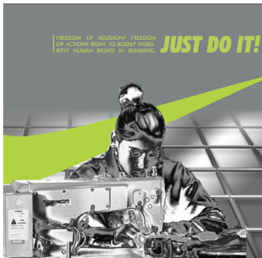
Nike is one of many companies lobbying against the Uyghur Forced Labor Prevention Act.