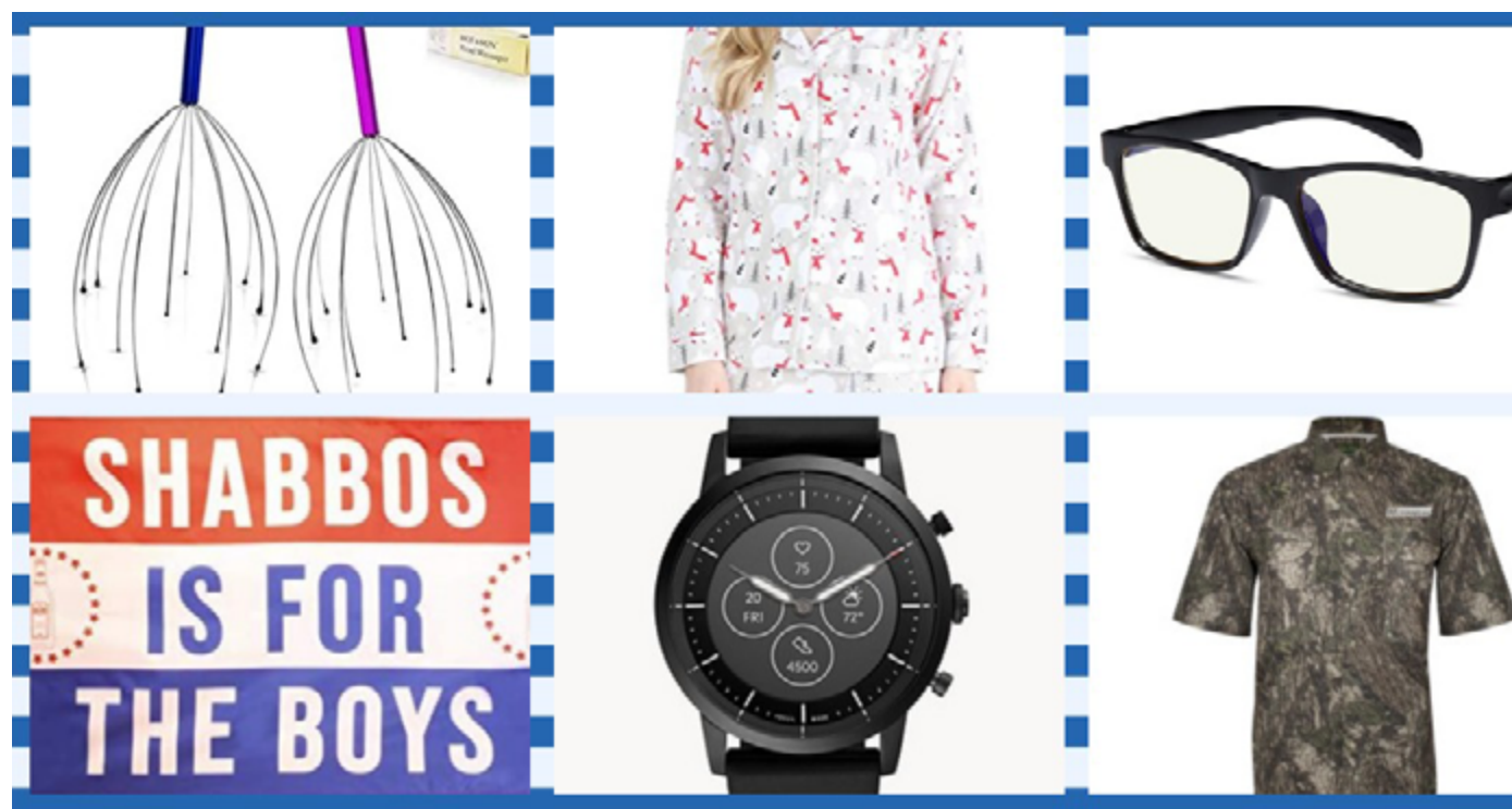
All Commentator staff members had the chance to share a Chanukah gift idea.

The Commentator wishes our readers a Chanukah Sameach!