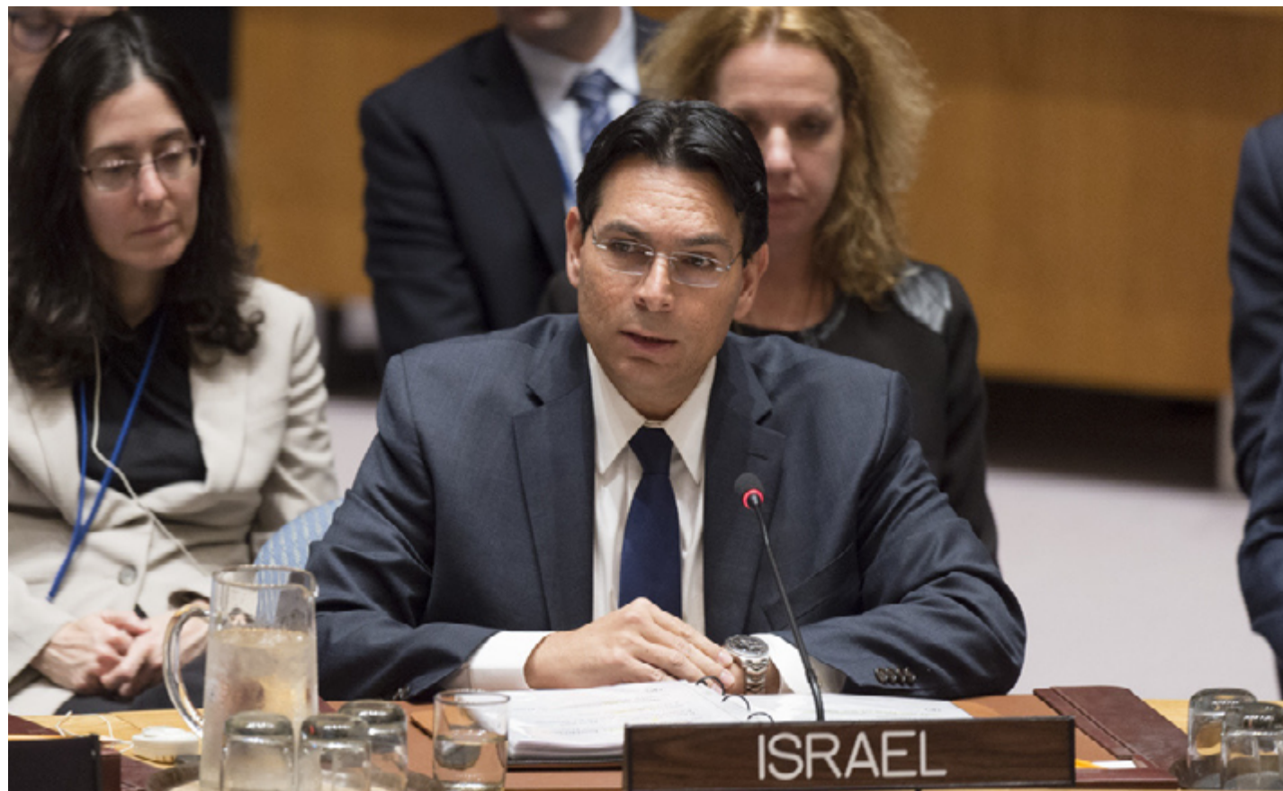
Danny Danon has been named a visiting professor in YU's Political Science Department