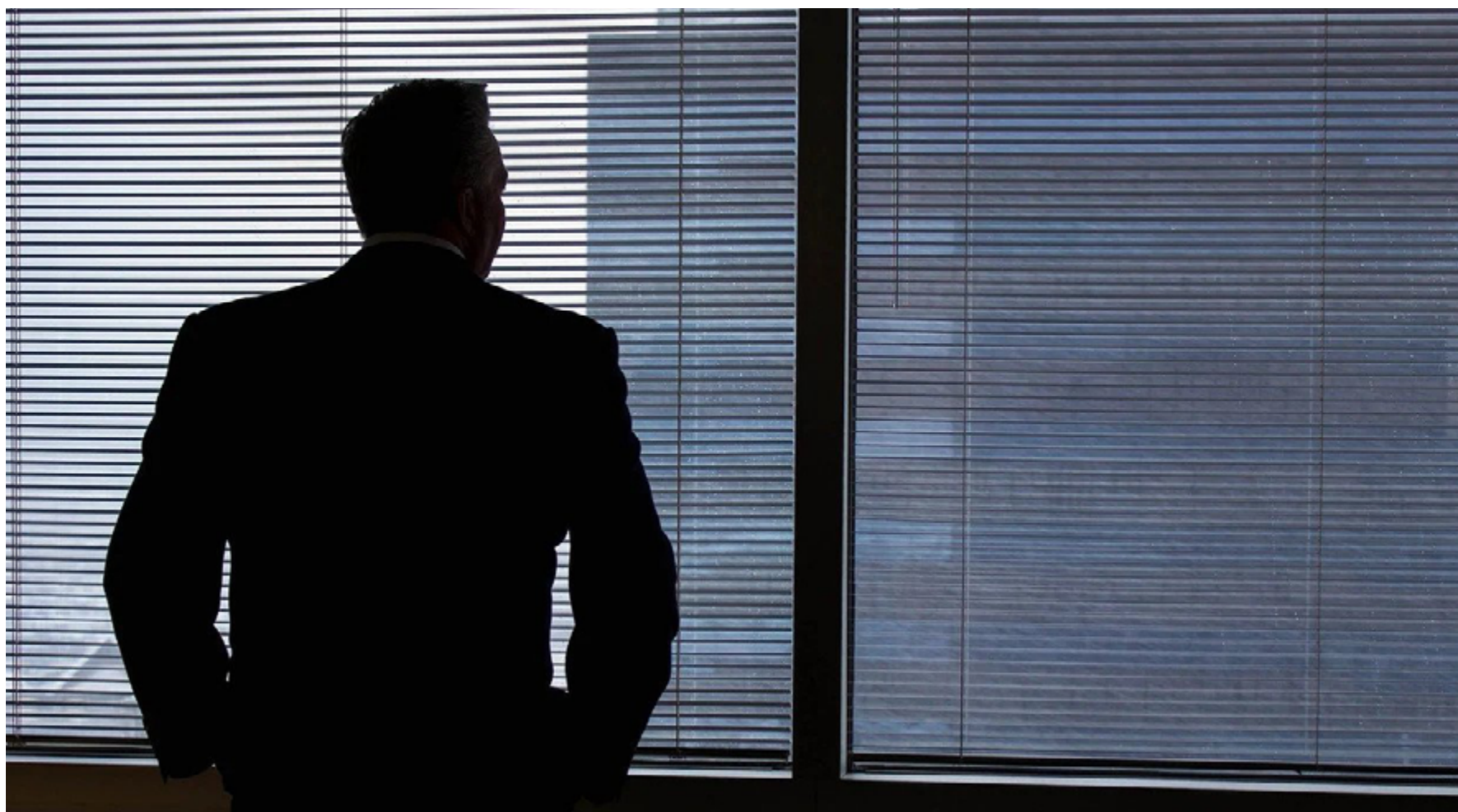
The enigmatic nature of SPACs prevents investors from knowing what they truly are and often this elusive complexion bars the SPACs themselves from knowing their very own identity.

Perhaps it is no surprise that of the 71 SPAC-acquisitions completed so far in 2020, 15 purchased companies that had no revenue in 2019, and the average return on SPAC investors' common stock has been a loss of 1.4%, according to research and investment management firm Renaissance Capital. These "shots in the dark" in which investors have financed somewhat blindly in SPAC's instead of in public companies whose project earnings are more legitimate and trustworthy suggests a rather pessimistic outlook for the medium-long-term future where American investors may start to find economic less creativity, less technological innovation, and, ultimately less profit.