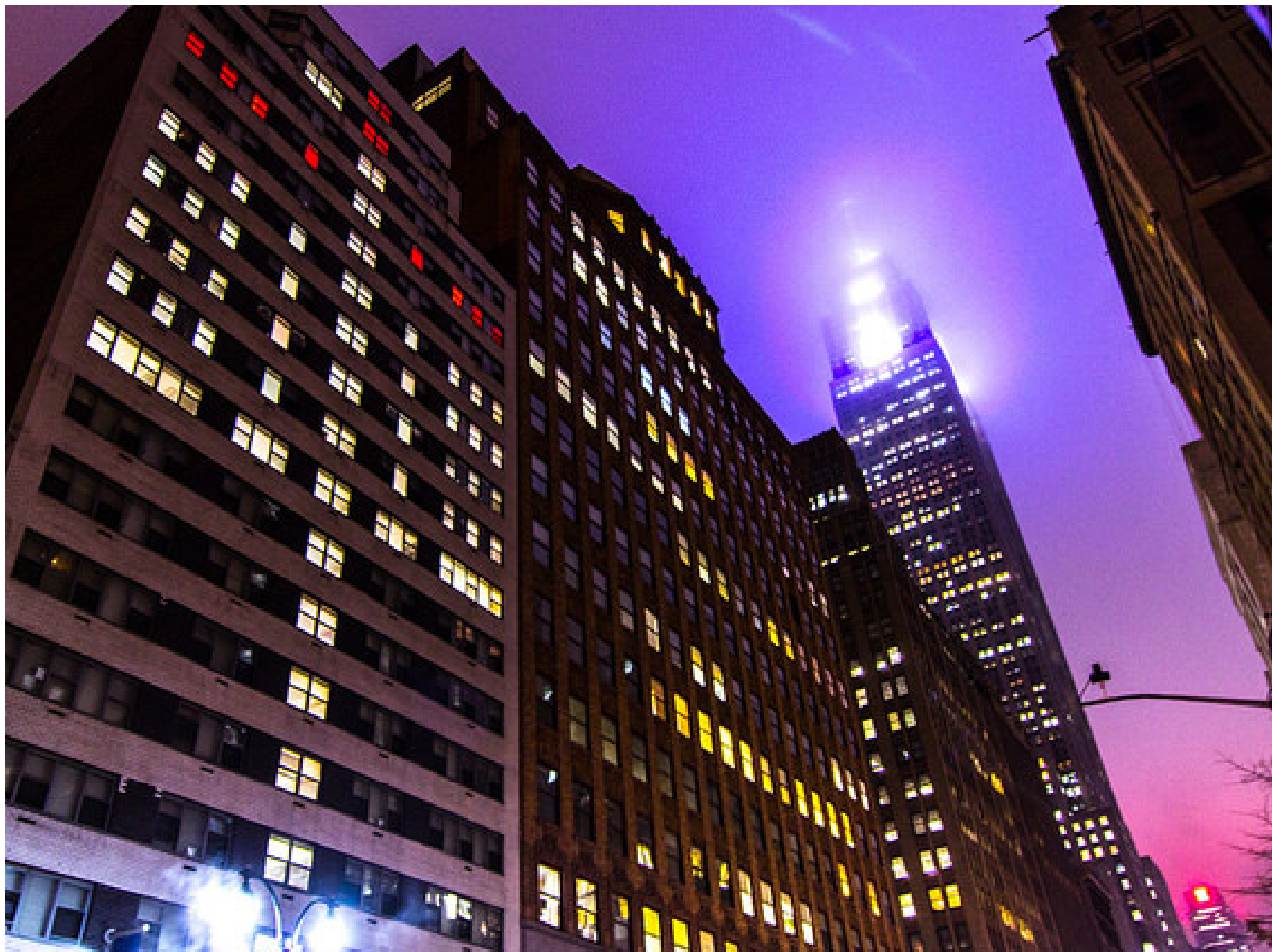
Brookdale Residence Hall